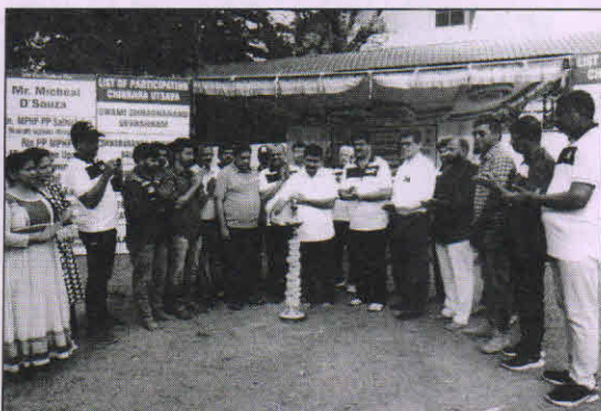
Inauguration of Chinnara Utsava 2023.