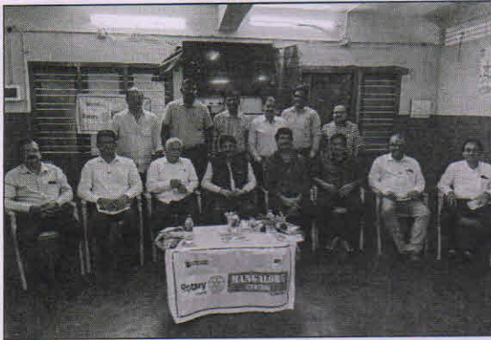
Donation of a TV Set to the inmates of Bala Samrakshana Kendra by our Club.