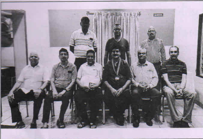
The Board Meeting of the Club for December.