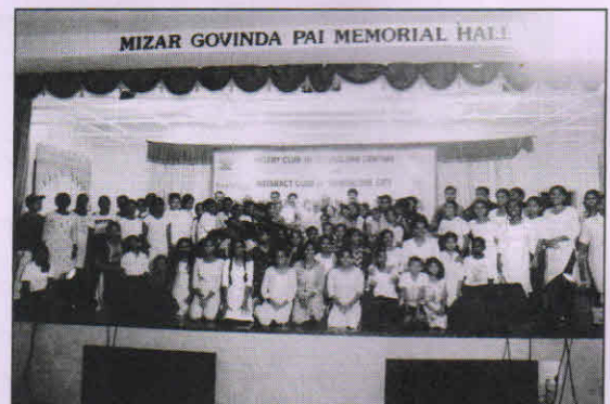
Valedictory Function of Chinnara Utsav - 2023