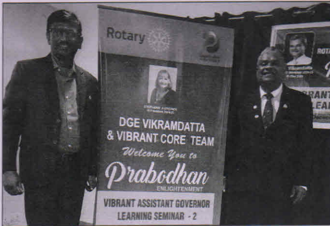
Our Club Delegates seen at Prabodhan - 2024-25