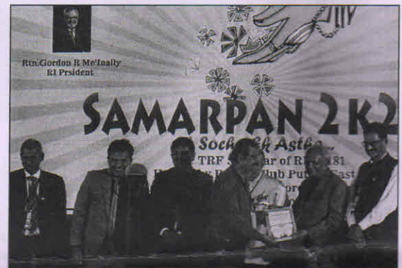
Our Club receiving the RI Presidential Citation 22-23 at Samarpan.