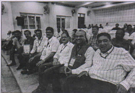
Our Delegates seen at Samrpan 2K23